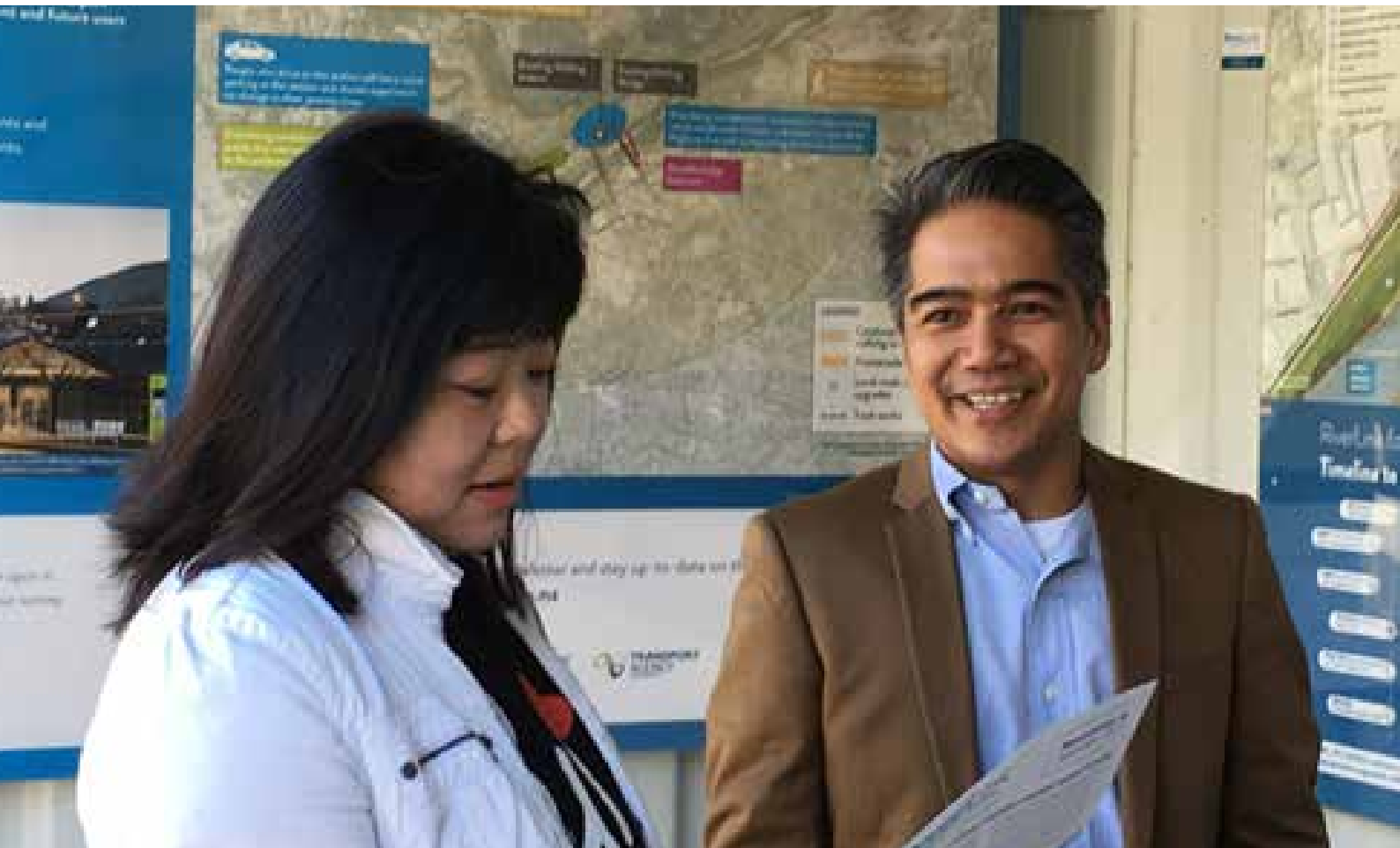
Rail commuters sharing their ideas on Melling station with the RiverLink project team

Parking was another hot topic. People strongly supported the proposal to provide additional parking at a new station but some wondered how the loss of the riverbank parking would impact parking availability for commuters. Several people mentioned that station parking is currently being taken by people who don't actually use the train but instead work in Lower Hutt and are attracted to the free parking. The project team were encouraged to consider ideas on how parking at a new station could be managed to meet the needs of the community.