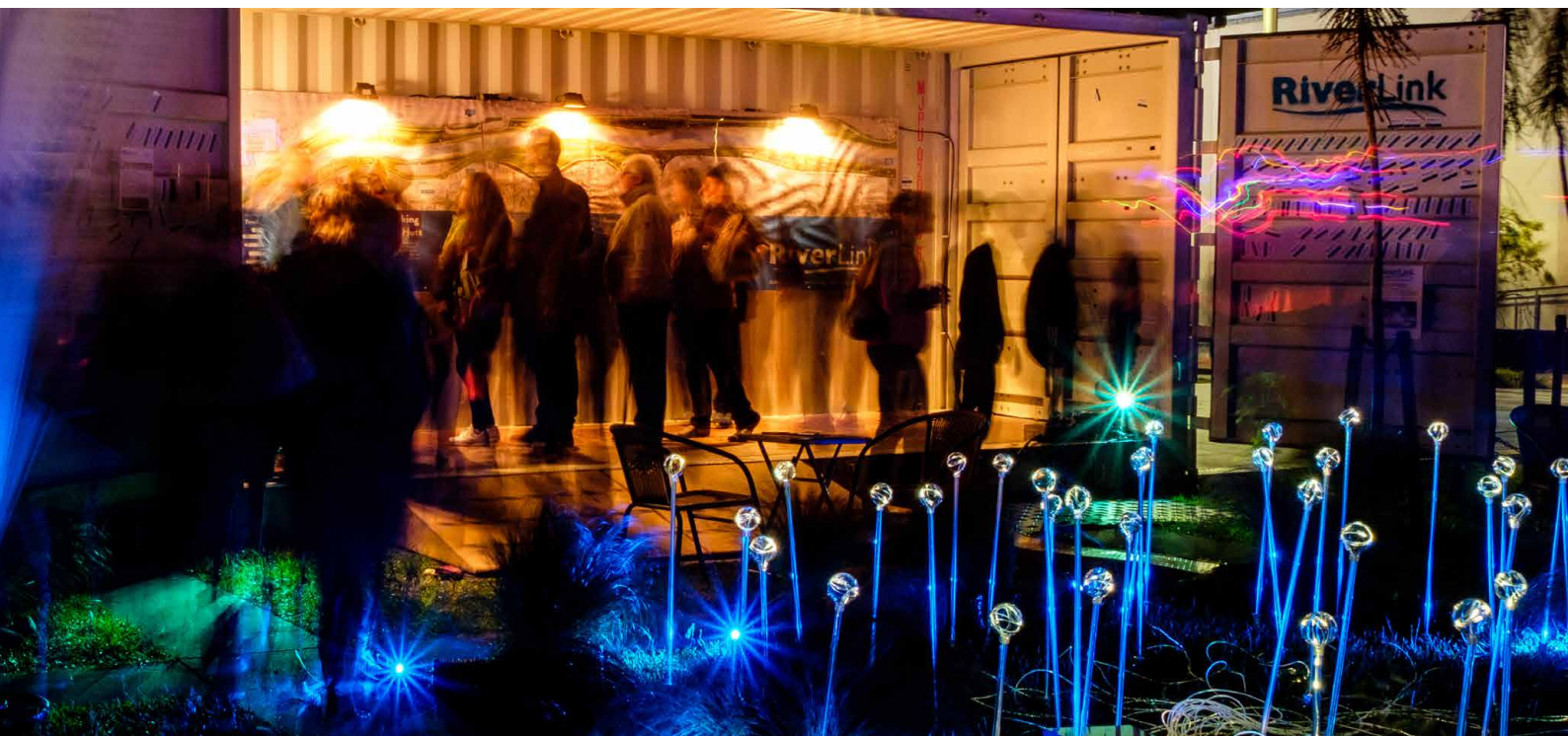
RiverLink community engagement at Highlight - Festival of Lights

RiverLink provides an opportunity for Lower Hutt to refashion the area between the city and the river into a lively recreational belt around the Hutt City centre. A promenade will be created that connects to and over the flood protection stopbanks and will include a pedestrian bridge from Margaret Street to Pharaoh Street, opportunities for urban living in new apartments and space for cafes and retail overlooking the river.